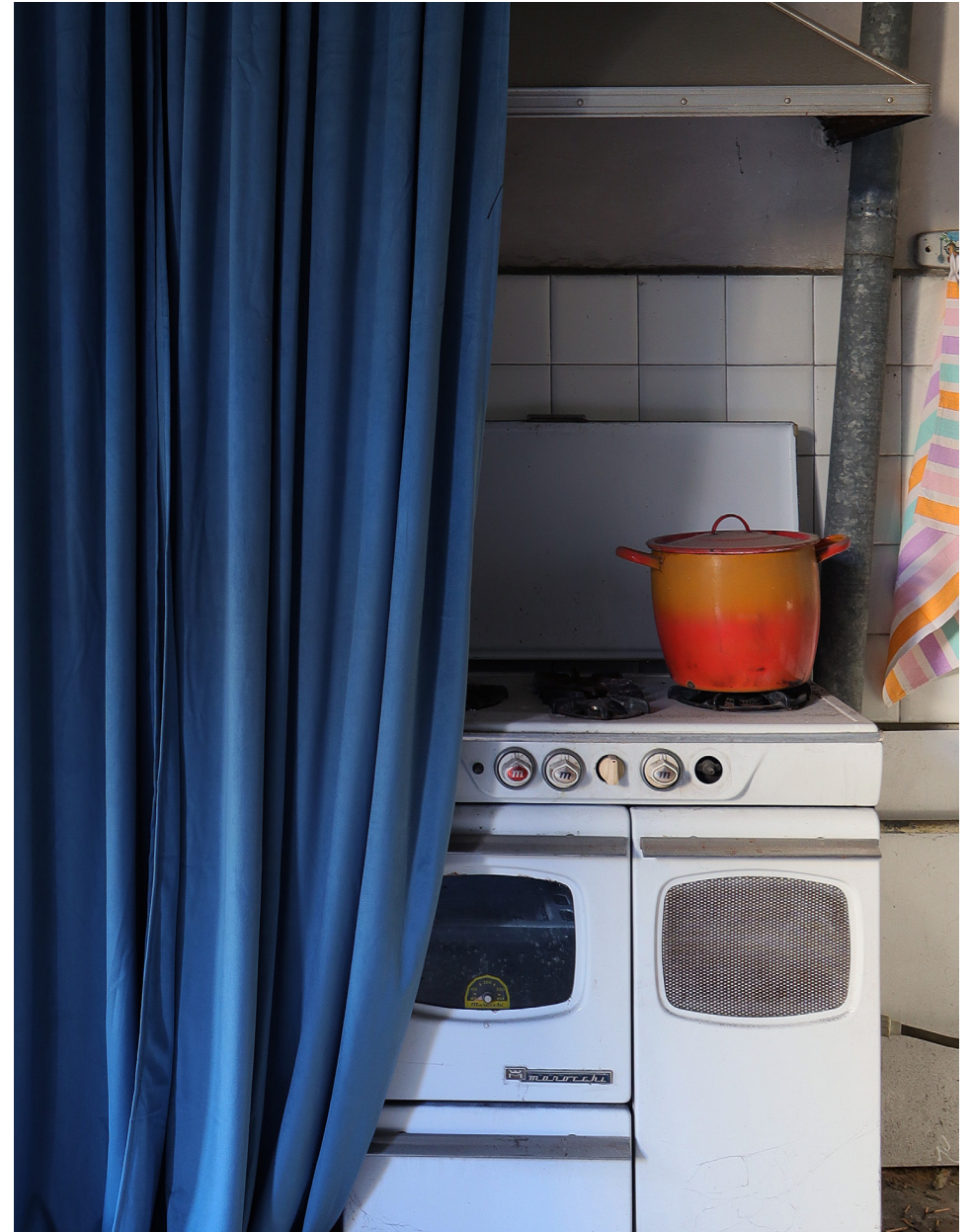
CONTEMPORARY DESIGN SELECTION