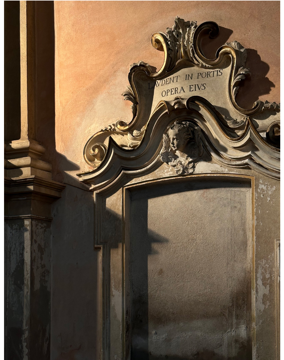
CONTEMPORARY ART AND DESIGN SELECTION